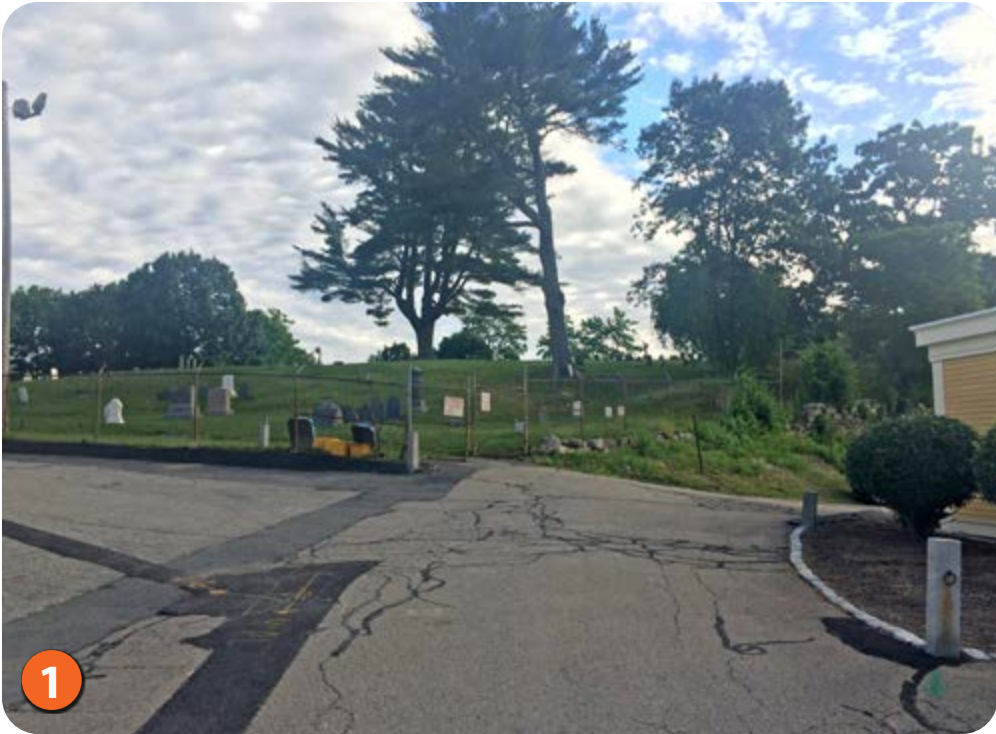
Railroad Ave entrance view.