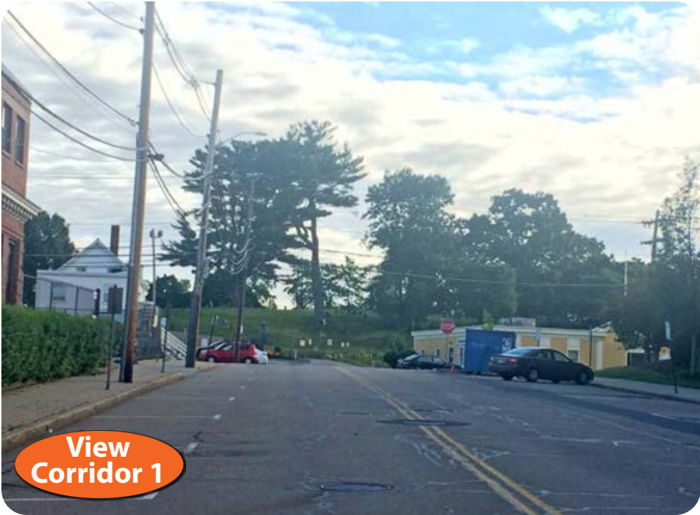
View corridor from Central St.