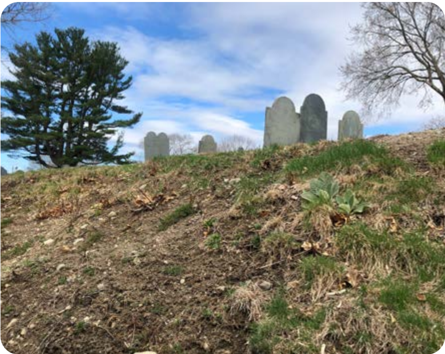
Steep slopes make it difficult to establish lawn.