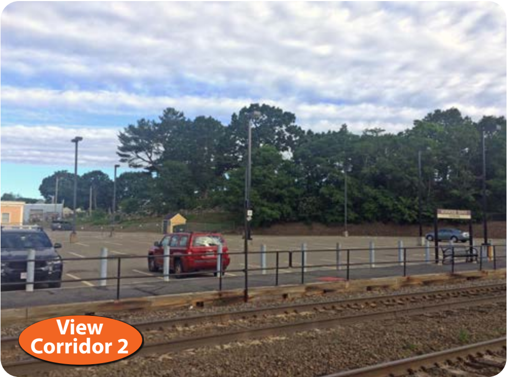
View from Norwood Depot station platform is dominated by the dense wooded slope.