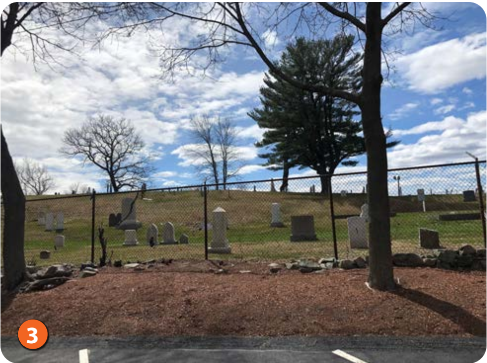
Attractive view in from parking north of cemetery