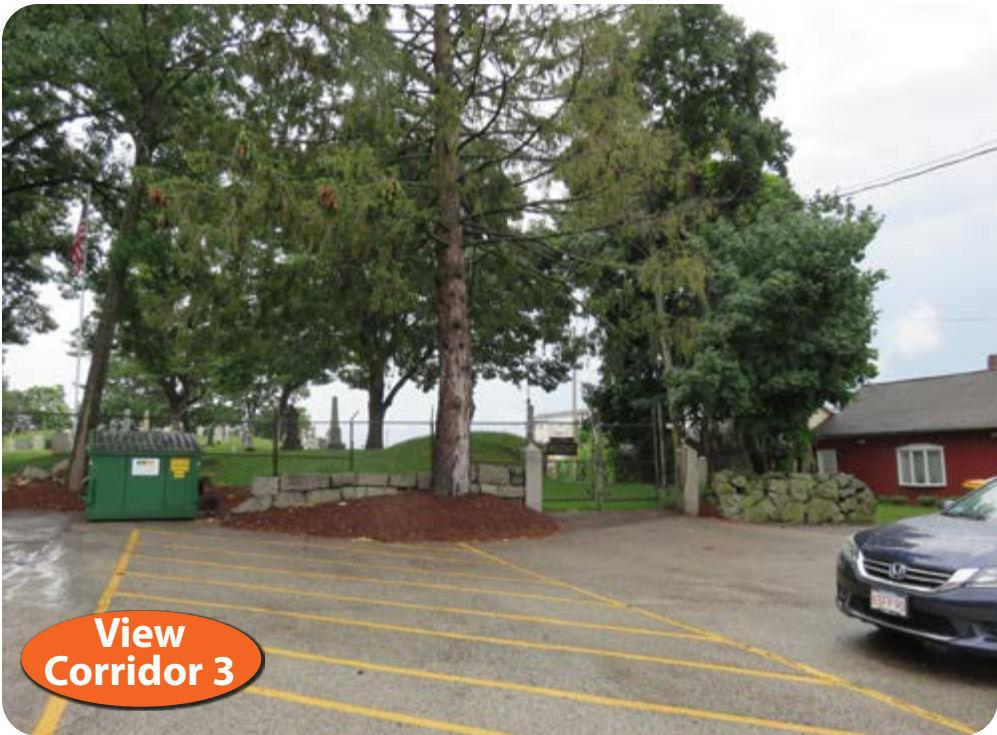
Washington St entrance view - entrance is tucked in the corner, the dumpster is a negative visual element