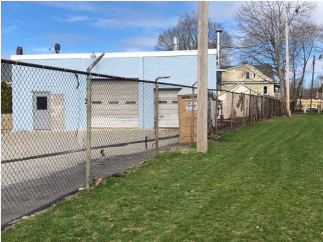
Abutter's garage and portable toilet are visual distractions.