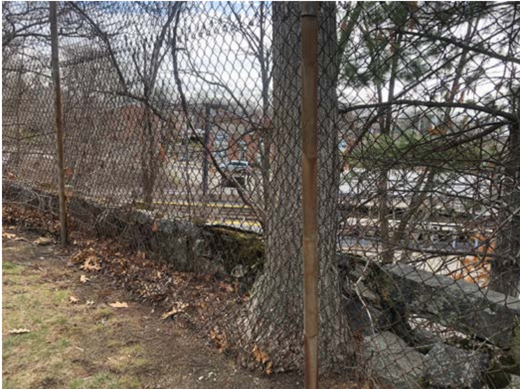
Views down to train station are screened by dense vegetation.