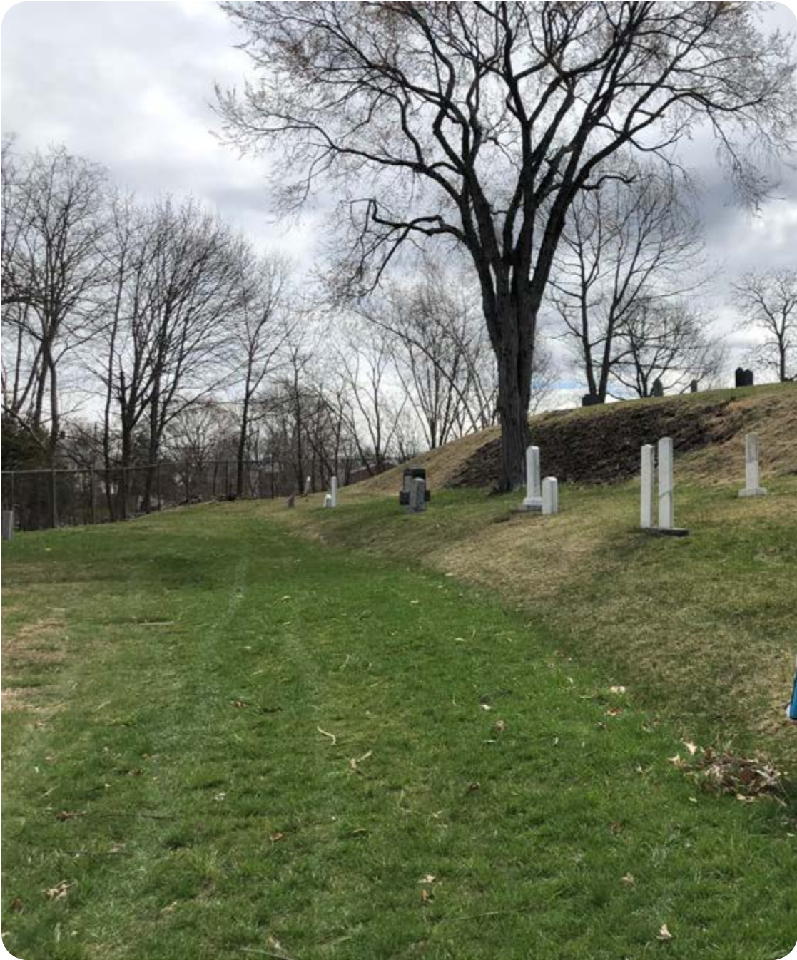
Topography is a defining character feature of the landscape.