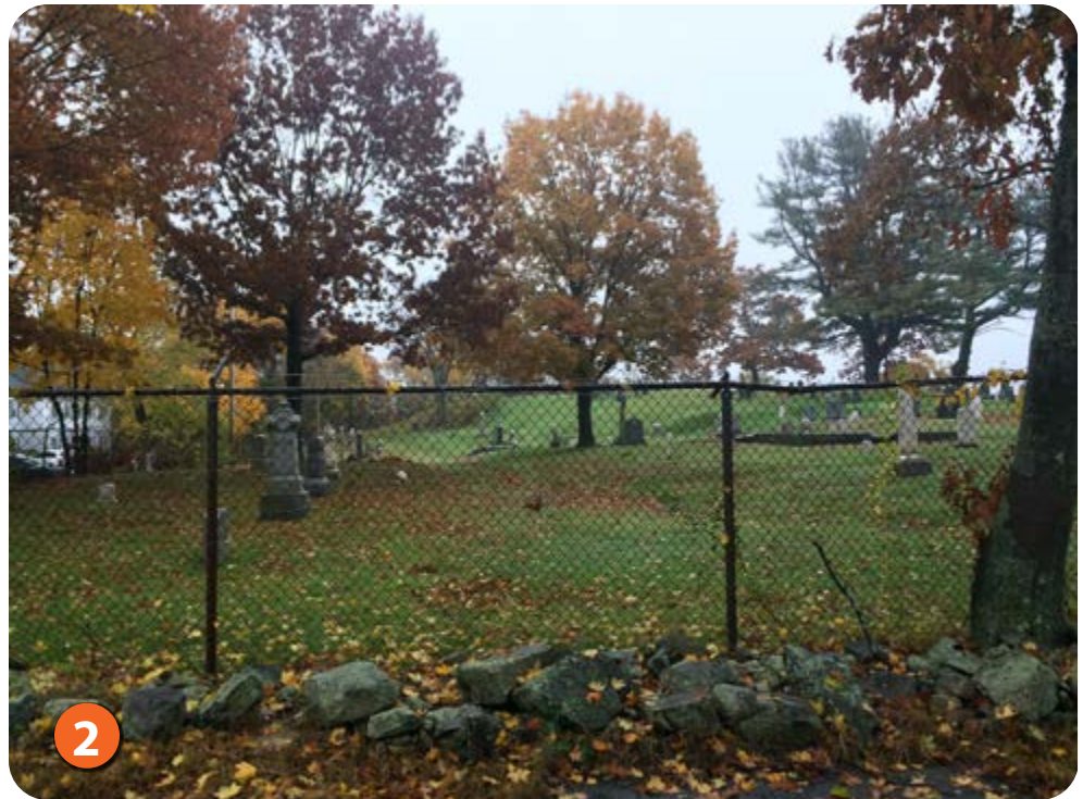
Attractive view in from alley along west perimeter.