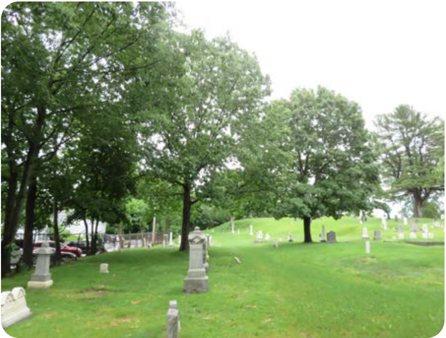
The Old Parish Cemetery landscape throughout the seasons.