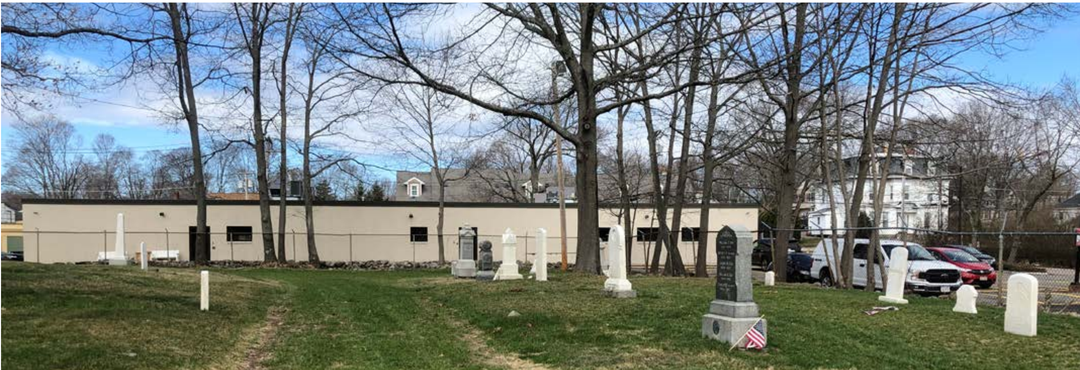
The blank abutter's facade and parking lot view could be softened with smaller ornamental trees and shrubs for filtered views.