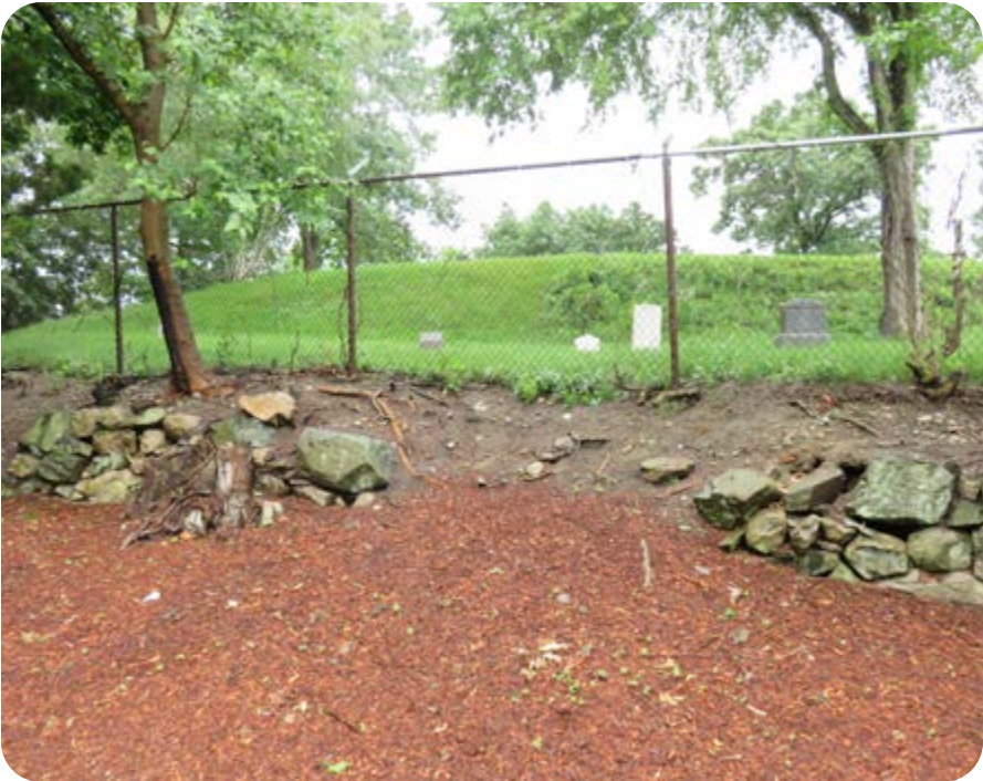
Eroded area along the north perimeter.